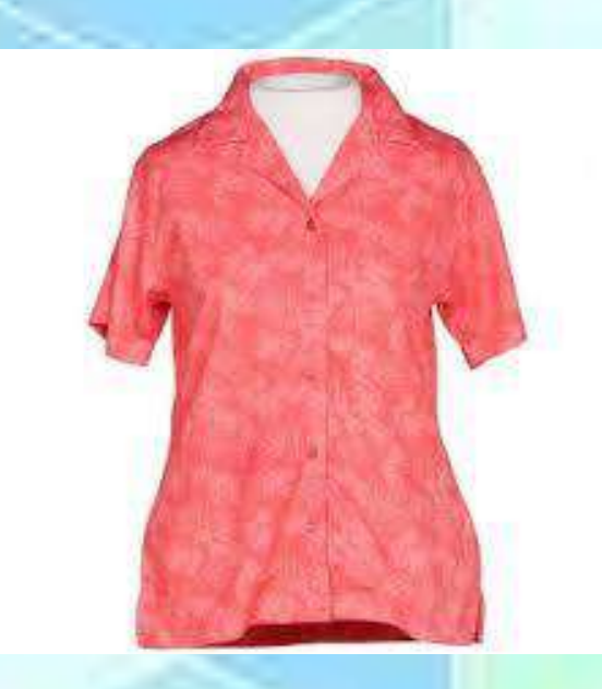
BABY GIRLS WEARS